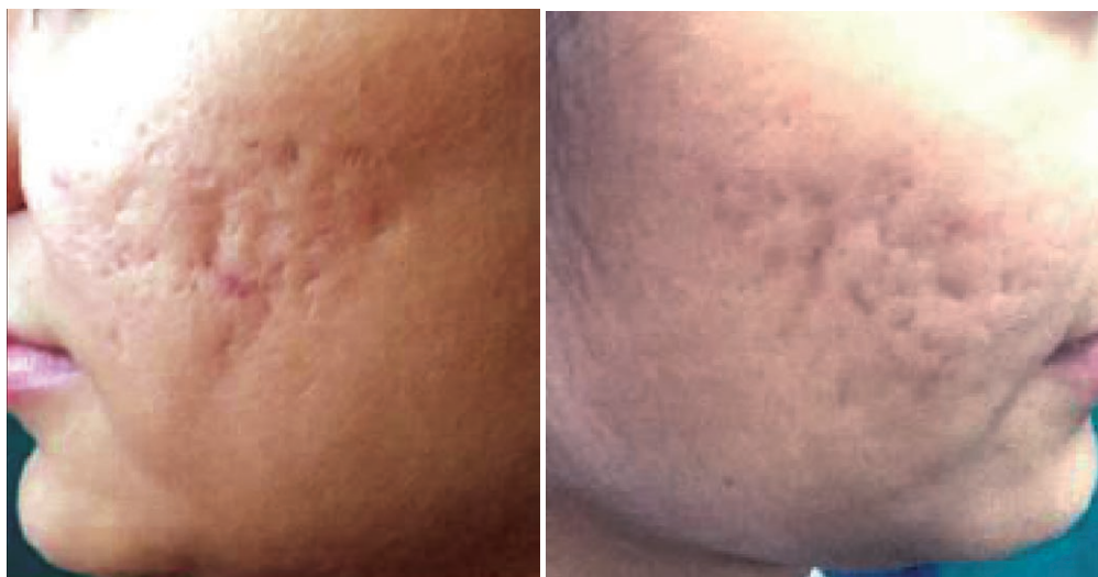
Figures 2 and 3. Left and right cheek of a patient with Grade 4 scarring before the treatment.