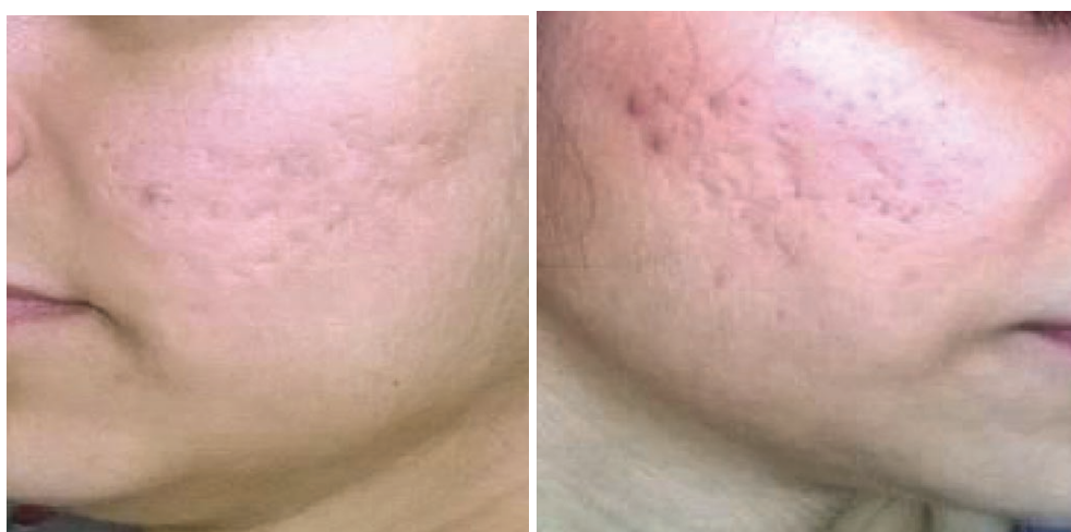
Figures 4 and 5. Left and right cheek of a patient who improved to Grade 3 from Grade 4 after 3 sessions of microneedling.