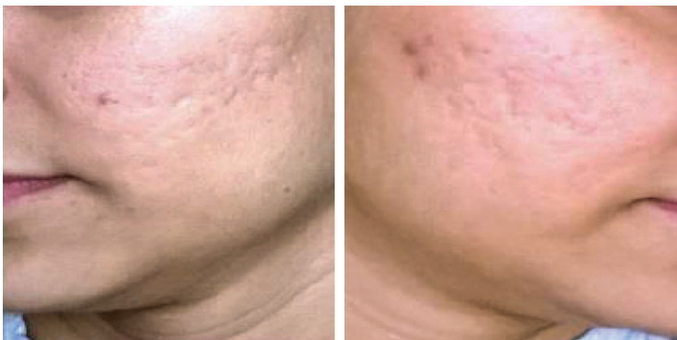
Figures 6 and 7. Left and right cheek of a patient who improved to Grade 2 from Grade 4 after completing treatment, grading was assessed three months post treatment.

Grade 2 and three cases with Grade 2 improved to Grade 1) whereas three cases (8.33%, 1 case each of Grade 4, 3 and 2) did not show any improvement. There was an overall improvement in 91.8% of cases.