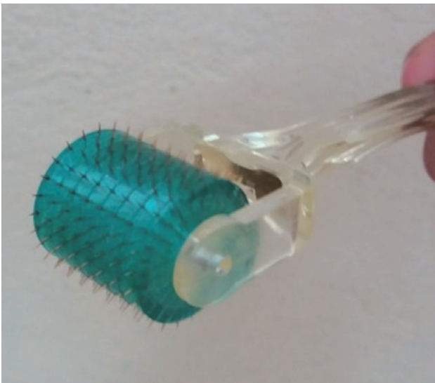
Figure 1. A dermaroller with 1.5 mm long needles.

A total of 40 cases with atrophic post-acne scars attending the dermatology outpatient department of a tertiary care hospital were recruited for the present study which aimed to establish the efficacy of microneedling for atrophic facial acne scars. Only patients aged 18 years and above with Grade 2 to Grade 4 atrophic scarring were enrolled. Cases with active acne, active bacterial or viral infection, keloid tendency, diabetes, pregnant females, lactating mothers, who were taking oral steroid or anti-coagulant therapy were excluded from the study. Informed written consent was obtained from all the patients. All enrolled patients with atrophic scars were graded according to Goodman and Baron's acne scar grading system. 7 Digital photographs of the affected part