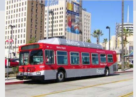
Bus Ridership Profile