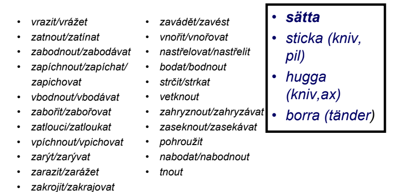
Figure 2. X inserts a sharp object into Y: verbs for insert in Swedish vs. in Czech

by Fig. 2. Besides, you can also sätta a plate on the table, as well as you can ställa it ( put vertically or something vertical), while the plate, once placed on the table, stands there ( stå ). Jakobsson (1996) claims that a plate can also ligga ( lie ), but only when it is positioned upside down or when it is broken. (No cooccurrence of ligga and tallrik ( lie and plate ) was found in PAROLE to prove it, though.) The motivation is that the functional part of the plate points up, which gives the concept of the entire object a vertical flavour, although it is actually flat and horizontal.