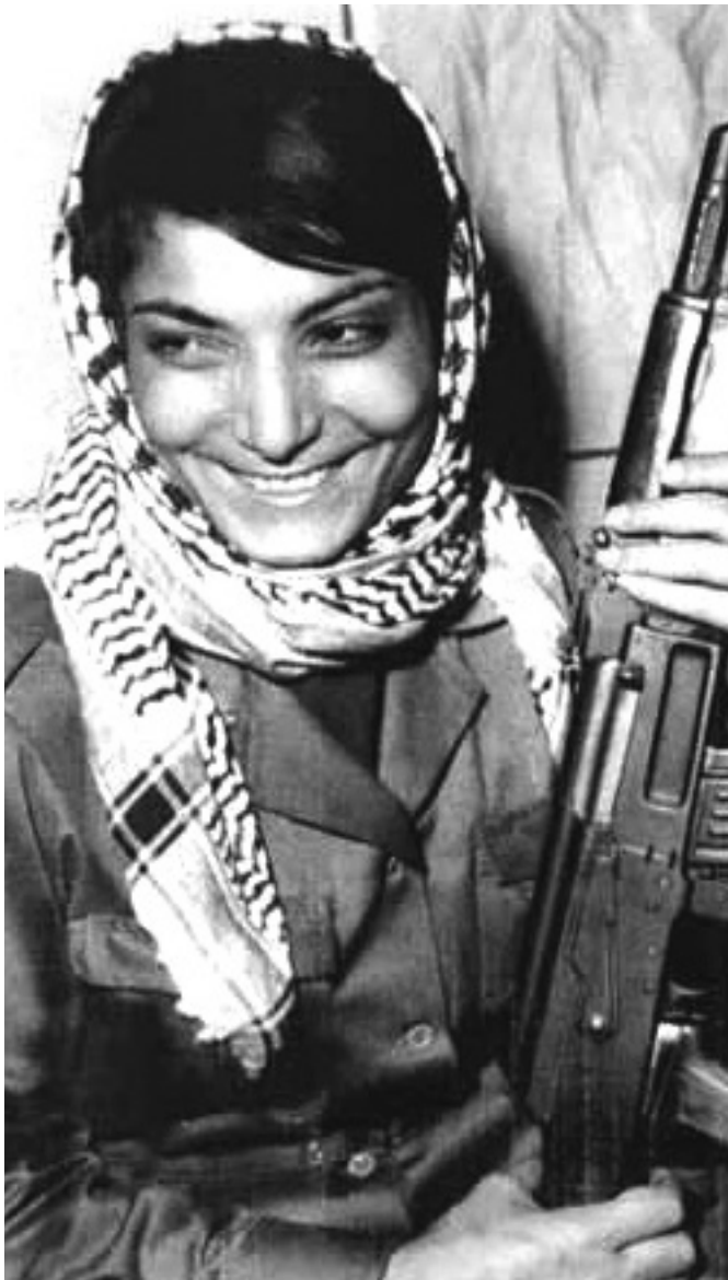
Leila Khaled, a role model for most of the young Palestinian girls growing up under The Occupation.