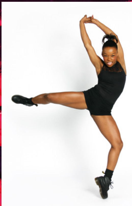
MAIN IMAGE: SCHOLARSHIPS 2014-15 ARTS ED - KISS INSET: SCHOLARSHIPS 2013-14 URDANG