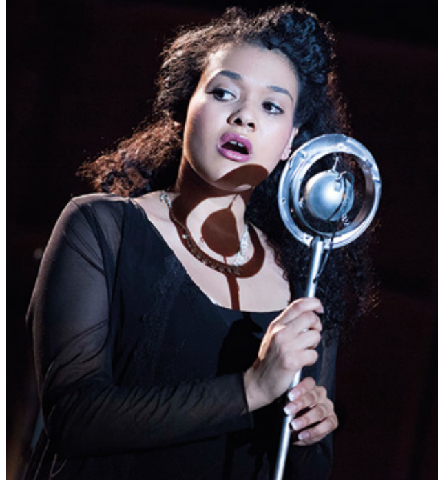
TOP: MOUNTVIEW - CITY OF ANGELS