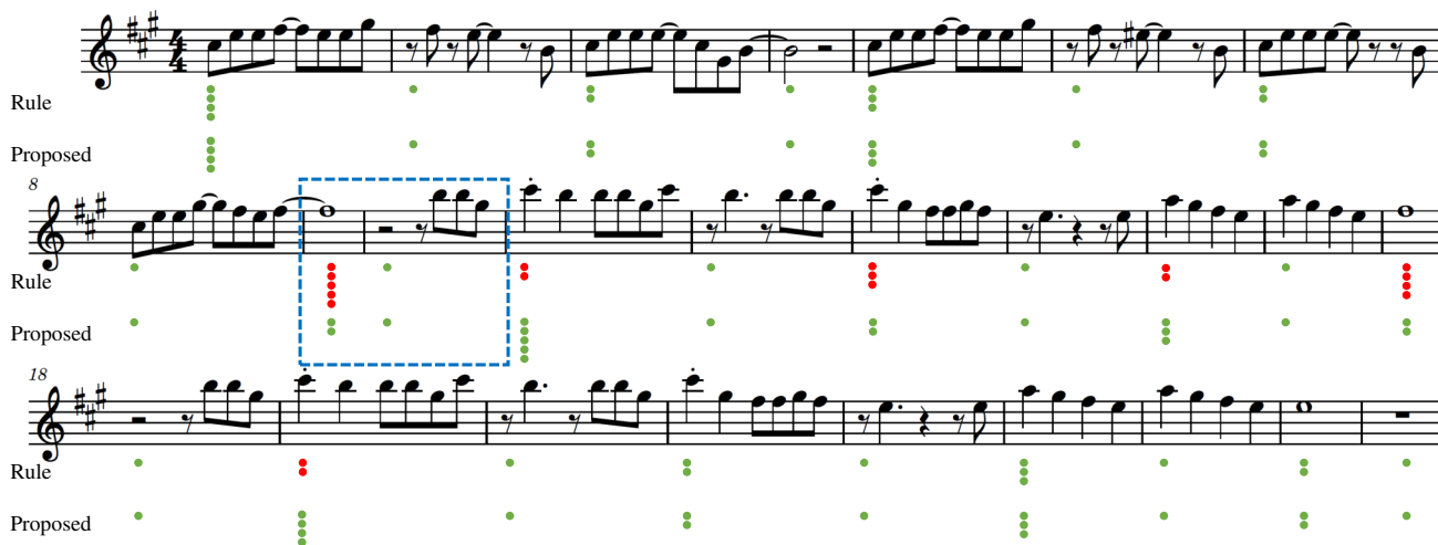
Figure 4. A case study with song RWC-POP No. 008 from the test split. The song is multi-track but we only show the main melody here. The metrical structure of the song does not satisfy binary regularity because of the 2-bar extensions in the pre-chorus (marked by a dashed blue box), causing hypermeter changes. The prediction of the proposed method aligns well with the reference. The errors in the rule-based prediction are marked in red (better viewed in color).