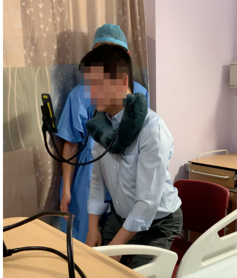
Figure 2: To stabilize the image and keep the patient’s face in the frame, the iPhone was mounted on a holder that extended from the neck and was cushioned by a U-shaped neck pillow above the patient’s sternum.

During each action, the app recorded video of the patient’s face while the research coordinator wrote down the reported pain score (and later entered it into the research database). The video of the patient’s face was recorded with an iPhone XR (running iOS version 12.3.1). Most video was recorded with the iPhone’s TrueDepth camera consisting of a structured light transmitter and receiver, a front-facing camera, and a time-of-flight proximity sensor. In addition to the video, the camera provided a 3D mesh of the face and BlendShape coefficients via Apple’s ARKit API that we recorded as well. To evaluate an alternate capture method, video for the deep breath action was recorded with iPhone’s rear camera that does not provide a 3D face mesh.