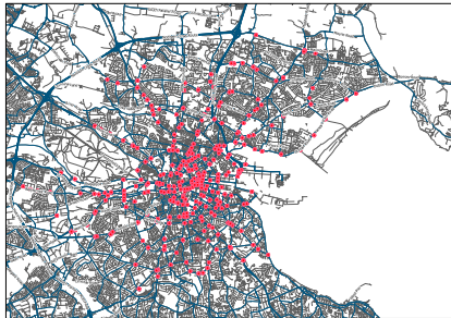
Fig. 2. Placement of traffic sensors.

We prepared a 5-fold cross validation, i.e. 20% of the full data was used for testing in each split, providing averaged results and standard deviation (SD). As our experiment dataset is fully observed, we artificially concealed 50% of the test data. The STRF is used to predict the most likely values based on the remaining observations, and comparison with the originally measurements allows us to compute the prediction accuracy. We came up with three realistic scenarios why measurements might be missing: some SCATS sensors break down on single days (A1), only the beginning of the days are recorded (i.e. future prognosis) (A2), or all traffic sensors have random malfunctions (A3). Accordingly we prepared three different versions of the test data, and obtain the accuracy values A1-A3.