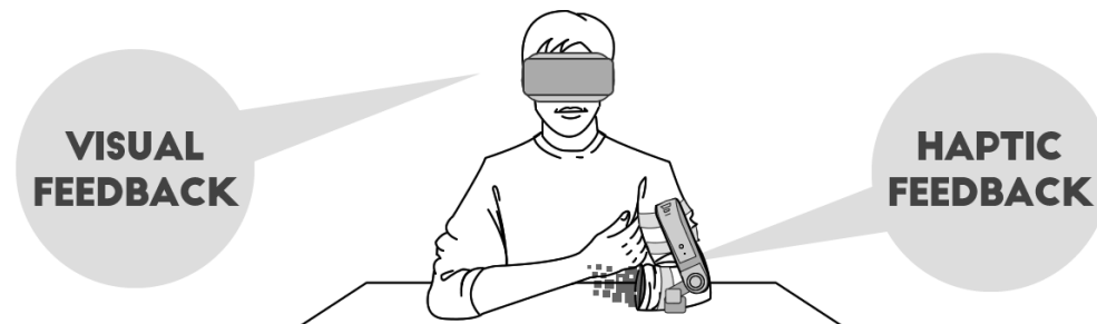
Figure 1: Our application allows users to experience having a missing arm and the Phantom Limb sensation. It provides both visual and haptic feedback to enhance the sense of embodiment.

3 St. Poelten University of Applied Sciences, St. Poelten, Austria