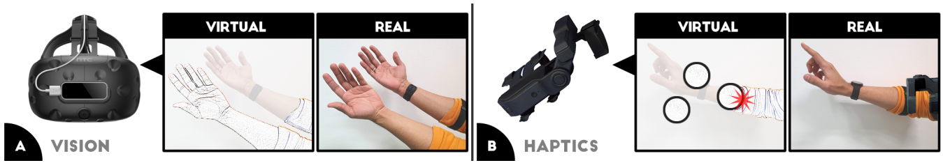
Figure 2: The application setup consists of two main parts: Vision and Haptics. (a) For the visual component, a motion tracker is attached to the VR headset to allow both visualization and control; (b) For the haptic component, a force feedback device is mounted on the user’s arm to convey information about collisions with the virtual objects.

condition. In this paper, we propose an experience with the same purpose of allowing empathy with the difference. Besides, we explore a different condition through the amputation.