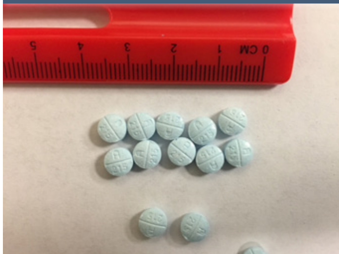
Figure 3: Counterfeit 30 Milligram Oxycodone Pills Containing Fentanyl.