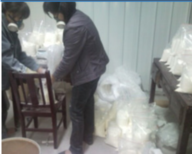
Figure 12: Synthetic Drug Factory in China.