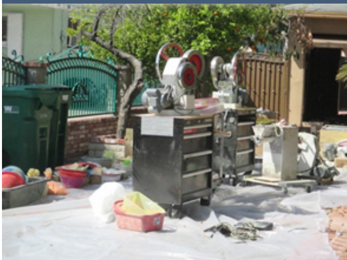
Figure 2: Pill Presses Used to Manufacture Counterfeit Prescription Pills in Los Angeles.