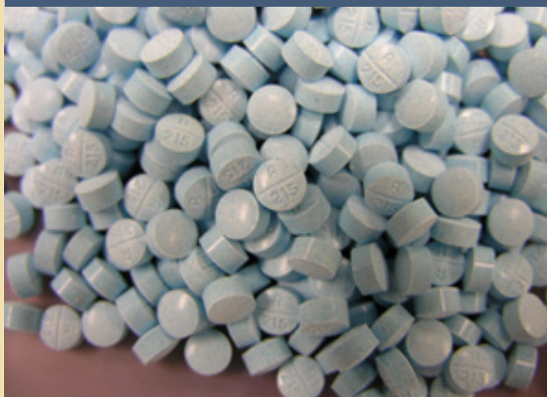
Figure 5: Counterfeit Oxycodone Pills Containing U-47700.