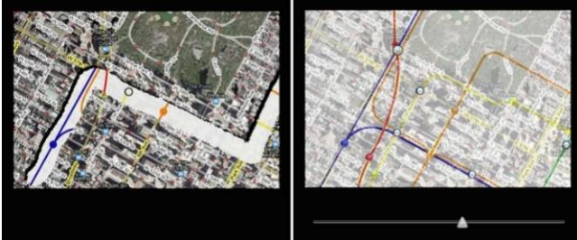
Figure 2. Our study compared scraping (left) with opacity fading using a slider (right).

We observed some interesting behaviors with the slider-based fading and scraping interfaces that informed the design of the formal study. When using the slider to fade through image layers, some users would hold their other hand over a point of interest to act as a visual placeholder. This led us to hypothesize that scraping has advantages over fading if the area being investigated has an arbitrary or large shape – not just a single point or line.