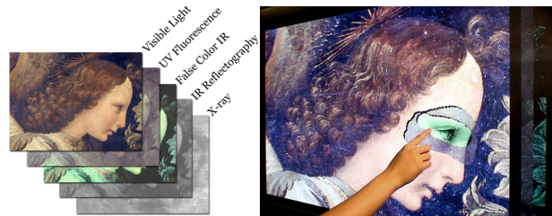
Figure 1. Multi-spectral scans of a painting (left); scraping through the layers of a painting using Wetpaint (right).

multiple layers of information, as when restoring a painting. By translating the physical act of scraping through layers into a touch interface on a large screen, it can be possible to make fast and accurate comparisons of multiple layers in an image. We introduce a system called Wetpaint that is based on the technique of scraping to provide an insight into the spatial and temporal relationship between multiple layers of an image.