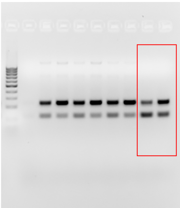
Full unedited gel for figure 7B