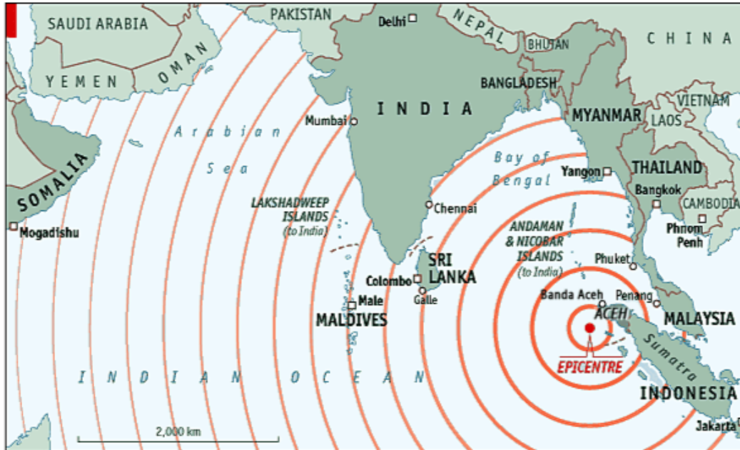
Figure 1. Map of the 2004 Indian Ocean Earthquake and Tsunami