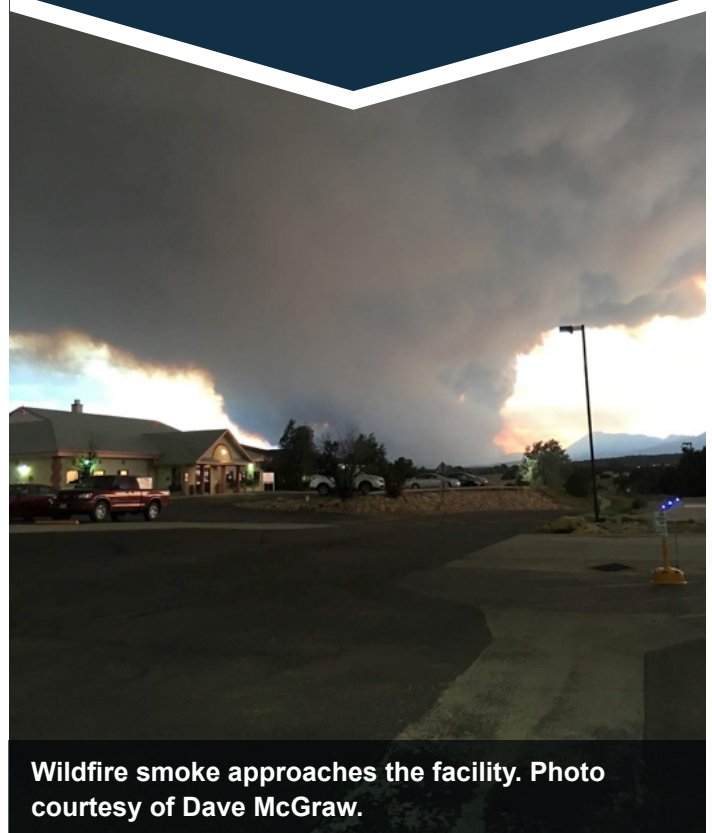
Wildfire smoke approaches the facility.