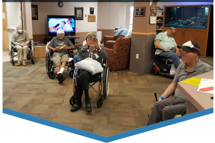
Residents waiting to evacuate.

Understanding (MOU) with a nearby community, and they sent a few vehicles down to help with transportation. Most of our receiving facilities also sent buses down and we used some of our own vehicles. Only one resident needed specialized transportation.