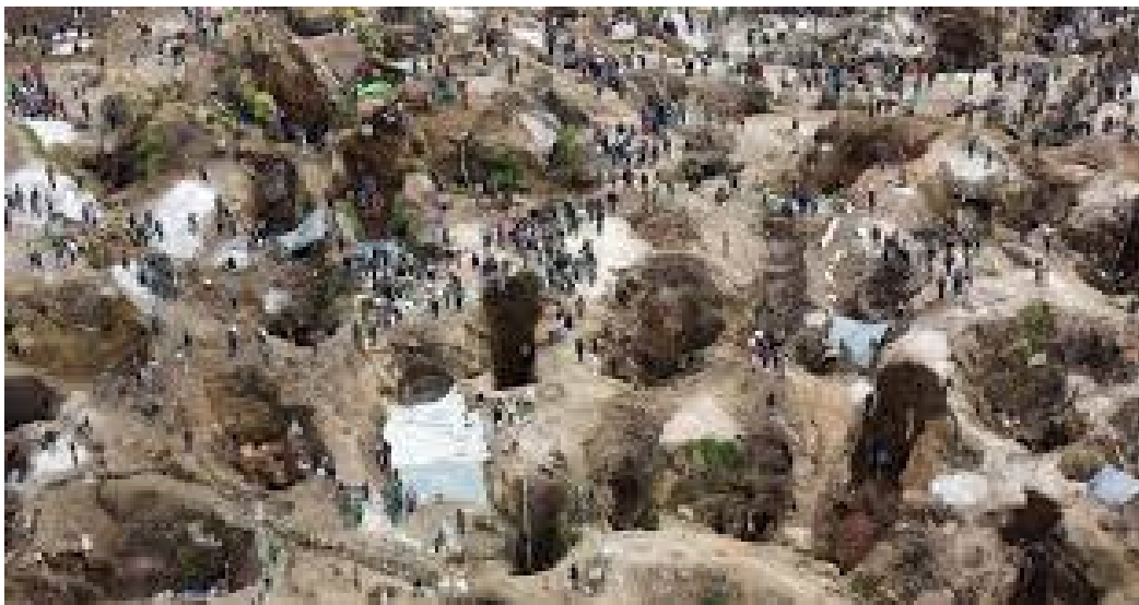
Luwowo Coltan mine near Rubaya, North Kivu [DRC] the 18th of March 2014

This report is designed to provide political, historical and human rights context for cobalt mining in the DRC. By researching and creating this report HTS hopes to help raise awareness about the current situation and foster informed dialogue on solutions that work for both the planet and the people of the DRC.