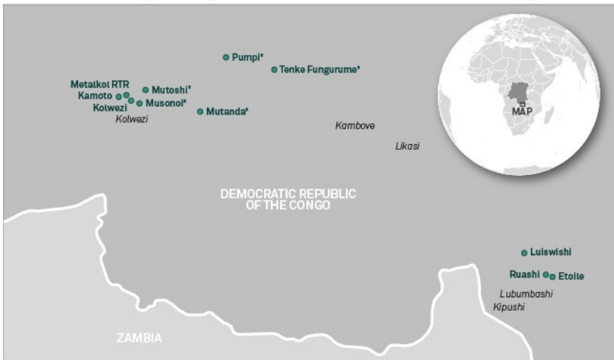
Selection of cobalt-producing mines in the Democratic Republic of the Congo

Data compiled Feb. 8, 2022. * Mine undergoing planned expansion or opening. Map credit: Joe Felizadio