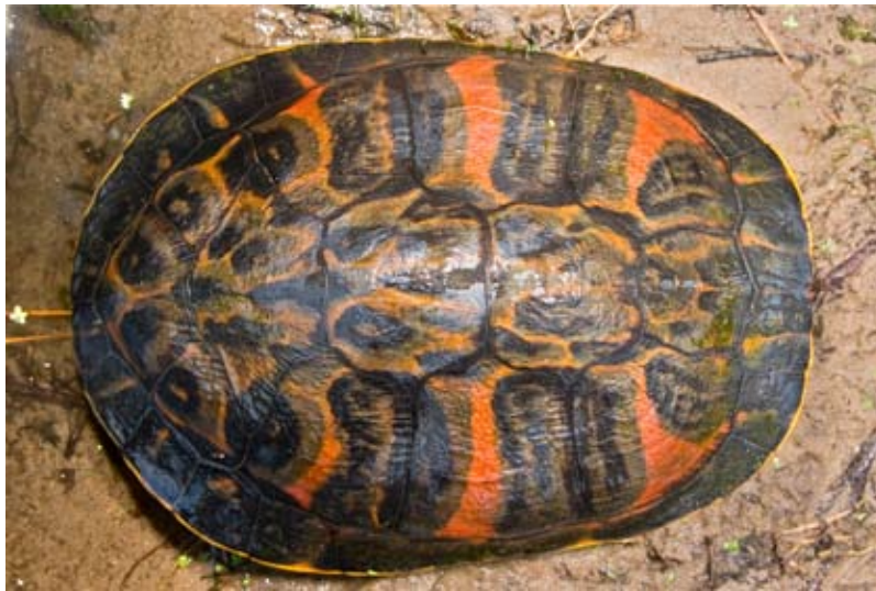
Figure 2. Pseudemys nelsoni , adult male from Marion County, Florida.

1951; Crenshaw 1955) considered nelsoni to be a subspecies of one of those two species, most have followed Carr. The species was included with all other Pseudemys in McDowell's (1964) expanded genus Chrysemys , but most current workers now reject that allocation. No subspecies of P. nelsoni are recognized, although geographic variation has not been examined.