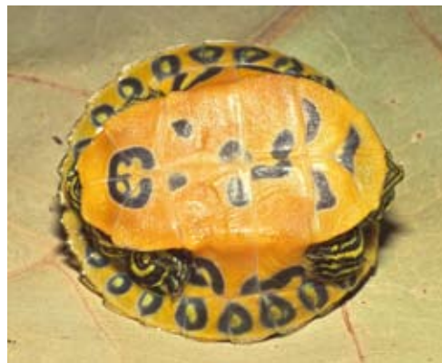
Figure 4. Pseudemys nelsoni, hatchlings from Florida.