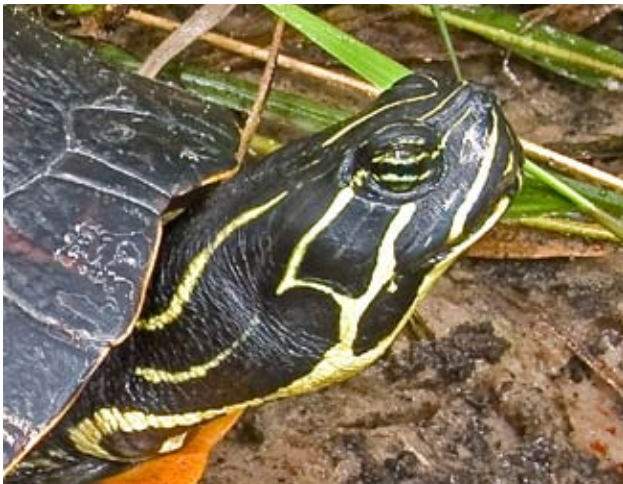
Figure 3. Pseudemys nelsoni , adult male from Lake County, Florida.

(1985) reported a fourth population of red-bellied turtles from the Pascagoula River system of Mississippi that he hypothesized as distinct, but these were shown by Leary et al. (2003) to represent P. alabamensis . Whether these disjunct populations would be better treated as subspecies rather than species awaits further systematic studies. Ward (1984) resurrected the subgenus Ptychemys to include the three named species plus P. texana , which formerly had been recognized as a subspecies of P. concinna . I do not