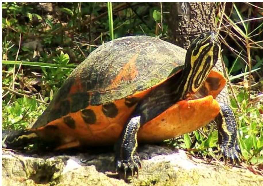
Figure 1. Pseudemys nelsoni , adult female from Big Cypress National Preserve, Collier County, Florida.

(1894) assigned specimens from north-central peninsular Florida to Pseudemys rubriventris ; subsequently, De Sola (1935) referred the Everglades population to Pseudemys alabamensis . Although some later authors (e.g., Mertens