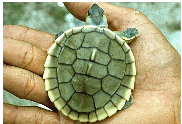
Figure 12. Hatchling Batagur affinis edwardmollii from the Terengganu River.