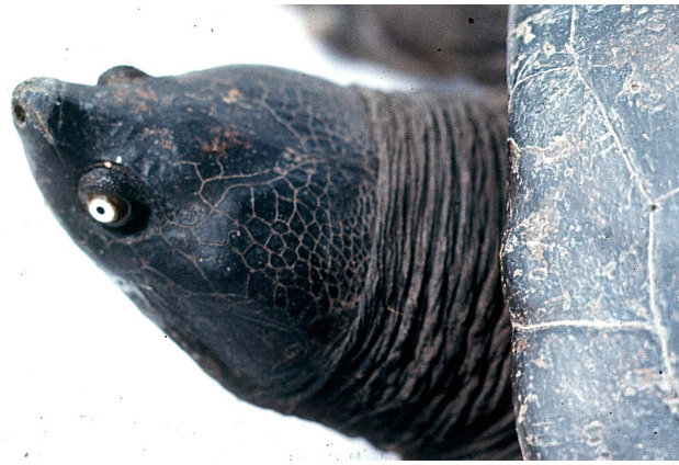
Figure 7. Male Batagur affinis affinis (455 mm CL) from the Perak River, western Malaysia, in breeding coloration. Note the irregularly shaped scales on the posterior head.

Like other members of the genus (except B. dhongoka ), Southern River Terrapin males are sexually and seasonally dichromatic. On the west coast, non-breeding males tend to be a dark olive-brown (somewhat darker than females in shell and skin coloration) and have a yellowish to cream-colored iris. Males in breeding condition have a strikingly white iris, a dark cornea, and a jet black head, neck, limbs, and carapace. Well before sexual maturity, the eyes of males tend to be lighter in color than those of females.