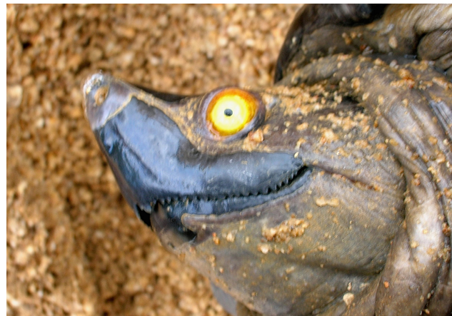
Figure 8. Male Batagur affinis edwardmollii from the Dungun River, eastern Malaysia, in April, slightly after the breeding season.