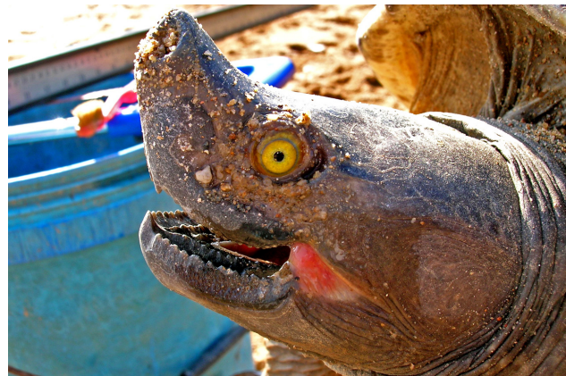
Figure 9. Male Batagur affinis edwardmollii from the Dungun River, eastern Malaysia, in June, after the breeding season.

Coloration varies geographically. River terrapins from the eastern coast of Malaysia ( B. a. edwardmollii ) are colored similarly except that females and juveniles have a silvery patch on the lateral side of the head behind the eyes. East coast hatchlings are also more colorful, having a bright silvery head patch and an olive to olive-brown carapace bordered