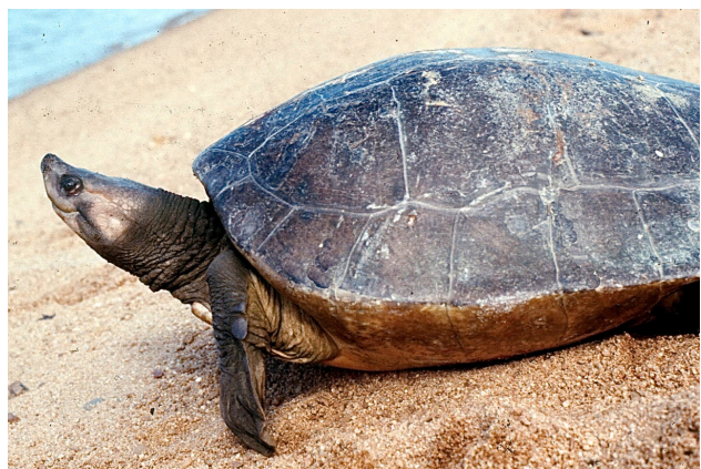
Figure 4. Adult female Batagur affinis edwardmollii (503 mm CL) from the Terengganu River.

The lower jaw possesses a complimentary medial cusp flanked by a shallow notch on each side. The choanae are partially covered by a flap bearing a small papilla (type A of Parsons 1968).