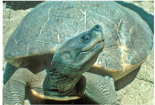
Figure 3. Adult female Batagur affinis affinis (538 mm CL) from the Perak River, western Malaysia.

The massive high-arched shell comprises a fourth to a third of the body weight. Vertebral scutes are wider than long. The plastron is truncated anteriorly, notched posteriorly, and is somewhat shorter than the carapace. The plastral formula is Ab>F><P>H>A>G. The entoplastron lies anterior to the humeropectoral seam. Buttresses of the shell are greatly expanded (obstructing about half of the anterior shell opening at their widest point) and extend nearly to the neural bones. Adult males retain costo-peripheral foramina, an unusual neotenic feature of the shell. Seams separating both the