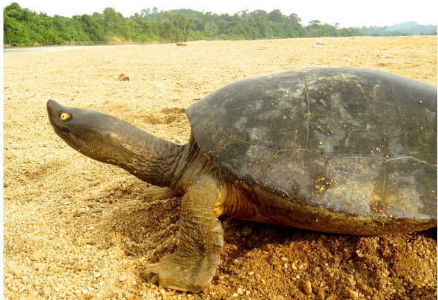
Figure 2. Male Batagur affinis edwardmollii (453 mm CL) from the Dungun River, Terengganu, eastern Malaysia.

River terrapins have relatively small heads with an upturned, somewhat attenuated snout. Batagur a. edwardmollii appears to have a narrower and sharper snout than B. a. affinis from the west coast of the Malay Peninsula, but this has not yet been quantified. The skin at the posterior end of the head is divided to form a number of irregularly-shaped scales. The upper jaw is bicuspid (a median notch flanked by pointed tooth-like projections).