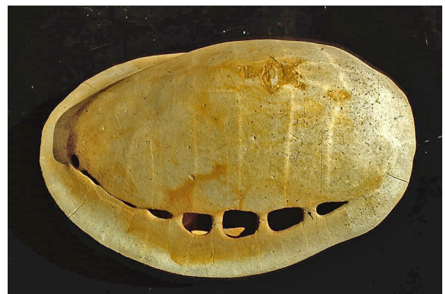
Figure 5. Carapace of male Batagur affinis (431 mm CL) showing costo-peripheral fontanelles.