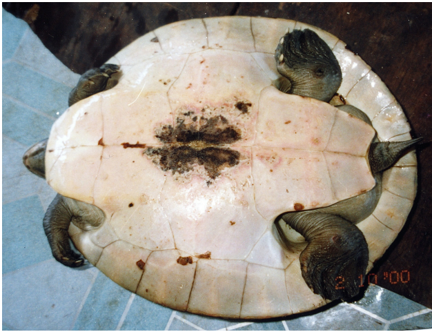
Figure 6. Subadult Batagur affinis edwardmollii from Sre Ambel, Cambodia.

scutes and bones comprising the shell fuse with age. Shells of old individuals become smooth and seamless.