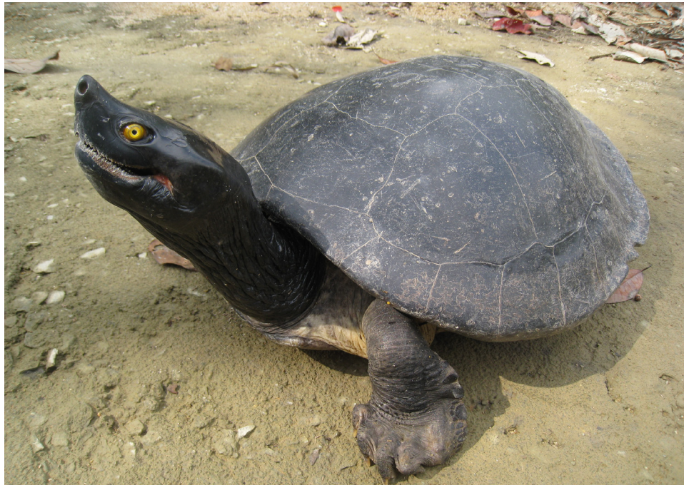
Figure 1. Adult male Batagur affinis edwardmollii from the Setiu River, Terengganu, eastern Malaysia, in breeding color.

However, the problem appeared still more complex, as coloration, morphology, and behavior of terrapin populations on the west and east coasts of Malaysia differed significantly (Moll 1980) with the latter bearing obvious resemblance to a relictual population in Cambodia. Praschag et al. (2009) assessed the taxonomic status of the Cambodian relict population using phylogenetic analyses of three mitochondrial and three nuclear DNA fragments and compared them to all other Batagur species. Genetically, Cambodian Batagur were found to be closely related but distinct from B. affinis from Sumatra and the west coast of the Malay Peninsula. Morphologically, Cambodian Batagur resemble the distinctive B. affinis populations from the eastern Malay Peninsula that were not available for genetic study. Consequently, Praschag et al. (2009) described the unnamed Batagur populations from the eastern Malay Peninsula and Cambodia as the new subspecies Batagur affinis edwardmollii that presumably once inhabited estuaries surrounding the Gulf of Thailand.