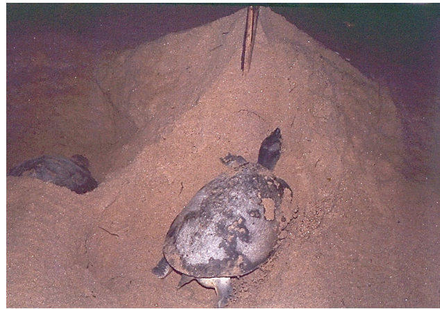
Figure 13. Batagur affinis affinis nesting at night in January 1976 at Bota Kanan on the Perak River, Perak, Malaysia. The hillock in the photo was built by the egg collector who felt it attracted the female turtles.

Distribution. — Batagur affinis affinis occurs along the western coast of West Malaysia and eastern Sumatra in Indonesia and into southernmost Thailand on the western Malaysian Peninsula. Batagur affinis edwardmollii is distributed along the eastern coast of West Malaysia and the Songkhla region of adjacent southernmost eastern peninsular Thailand bordering the South China Sea, and Cambodia, where a relict population survives in the Sre Ambel River system. Formerly it extended into the Mekong delta of Vietnam, with animals occurring upstream to Tonle Sap Lake in Cambodia. Additionally, archaeological turtle fragments from the lower Bang Pakaong River of southeastern Thailand have been identified as Batagur , suggesting that B. affinis