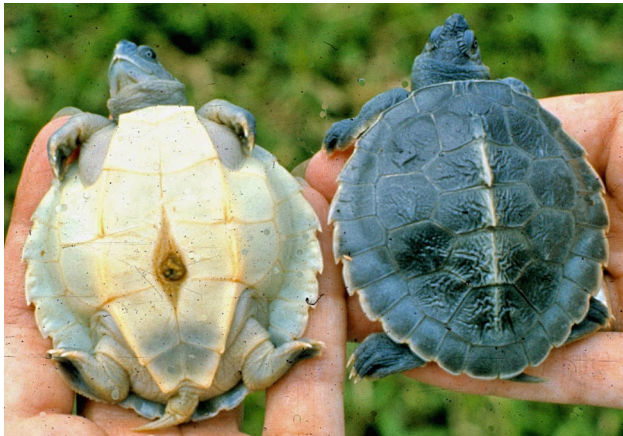
Figure 11. Batagur affinis affinis hatchlings from the Perak River, Malaysia.

west coast averaged 438 mm CL (400–502 mm, n = 76) and 488 mm CL (430–546 mm, n = 156), respectively. East coast terrapins ( B. a. edwardmollii ) averaged larger; females nesting on a Terengganu River beach (Moll, unpubl. data) averaged 552 mm CL (532–602 mm, n = 29), and a sample from the Dungun River (Chan, unpubl. data) averaged 537 mm CL (410–625 mm, n = 28). Based on Moll (1980), Gibbons and Lovich (1990) determined that female B. affinis were on average 11% larger than males in carapace length. Lovich et al. (2014) suggested that patterns of sexual size dimorphism among turtles are