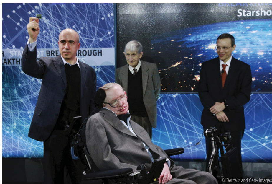
Public announcement of Breakthrough Starshot (April 12, 2016). With Yuri Milner, Stephen Hawking, and Freeman Dyson

Of course, it is possible to gain some limited information from remote observations using