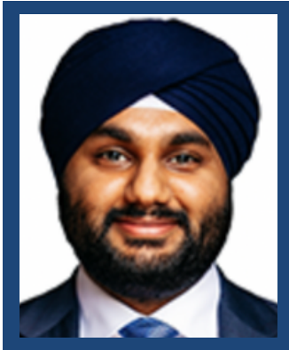
Hardeep Grewal , MPP (Brampton East)

Hardeep Grewal represents the Progressive Conservative Party. He is the Parliamentary Assistant to the Minister of Transportation.