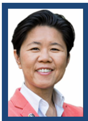
Kristyn Wong-Tam, MPP (Toronto Centre)