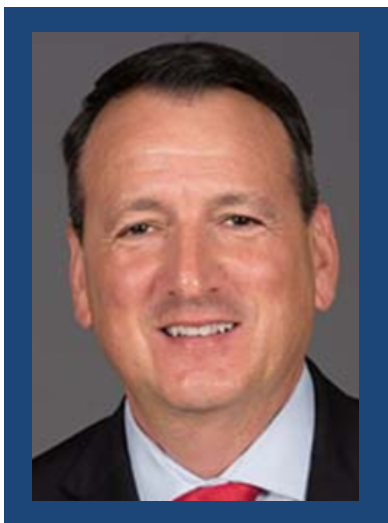
Greg Rickford, MPP (Kenora-Rainy River)