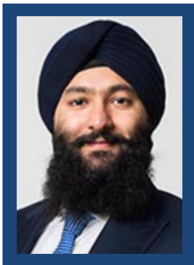
Prabmeet Sarkaria, MPP (Brampton South)