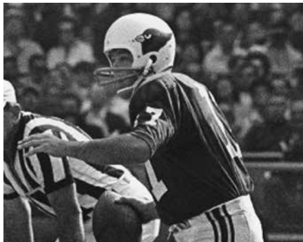
QB Jim Hart is the franchise leader in career passing attempts, completions, yardage and touchdowns.