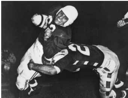
Charley Trippi's 5.1-yard rushing average is the best career average in Cardinals history.

9 .....Ottis Anderson, 1979 7 .....Ottis Anderson, 1979 6 .....Ottis Anderson, 1980 5 .....Jim Otis, 1976