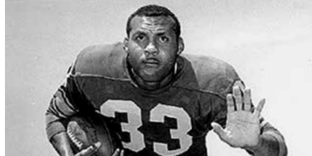
Hall of Fame RB Ollie Matson holds the franchise record for career kickoff return TDs (6).