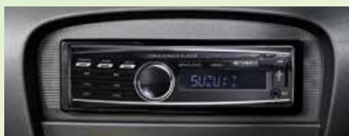
BT / USB / AUX / Radio Player / Power Amplifier