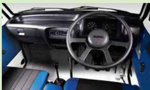
Newly designed instrument panel with New 4 spoke steering.

With upgraded features and advanced Euro-II technology, now your Suzuki Bolan is more environment friendly. Now drive the extra mile, with high standard engine performance in low fuel consumption and inexpensive maintenance that let your savings augment in an economical way!