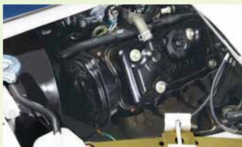
New EFi Engine.