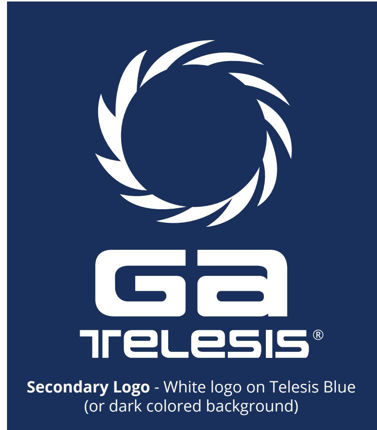
Secondary Logo - White logo on Telesis Blue (or dark colored background)