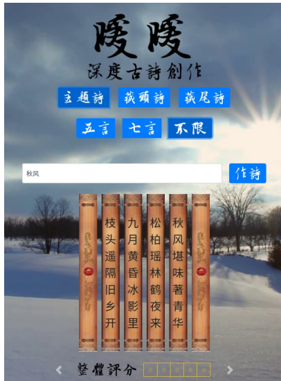
Figure 3: The website interface of our poetry generation system in which users are asked to input the query and rate the generated poem based on certain metrics [best viewed in color].