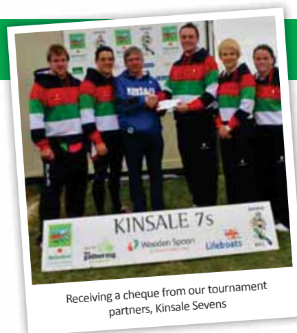
Receiving a cheque from our tournament partners, Kinsale Sevens

The Kinsale 7's really was a brilliant way to kick off the 2013 Wooden Spoon 7's season and we would like to thank to tournament organisers for selecting Wooden Spoon as the tournament's official charity partner.