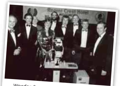
Wooden Spoon donation to the Eye Unit at Great Ormond Street, the first of many medical equipment donations

A headline printed on 23rd February 1984 stated “Turning defeat into success”, which is a fitting description of this society growing stronger and stronger with more support. Over the last 30 years Wooden Spoon has invested nearly £20 million in over 500 charitable projects that have benefitted over half a million disadvantaged children and young people throughout the UK. None of this would have been possible without the support of our members, the rugby community, the regional volunteers and our staff. We are proud of our legacy and our ambitious plans for the future.