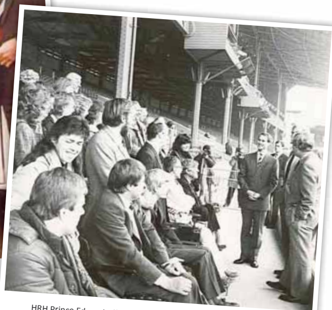
HRH Prince Edward officially opens the new wheelchair facilities at Twickenham in 1989

On 19th March 1983, the Irish ended their Five Nations campaign with a 10 point win over a struggling England, who had failed to win a match in the competition. Downhearted, a few luckless English supporters entered a Dublin bar in an attempt to drown their sorrows amongst their rival supporters clad in green. With as much jocosity that could be mustered by the English, they accepted a wooden spoon from their friends the Irish victors, symbolising their winless Five Nations disaster. From here the legacy was born.