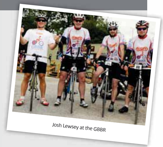
Josh Lewsey at the GBBR

Wooden Spoon would just like to say a huge thank you to Josh for his recent efforts, and we wish him the very best of luck in his new position at the WRU.