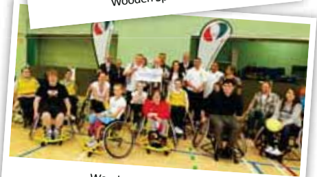
Wooden Spoon Isle of Man