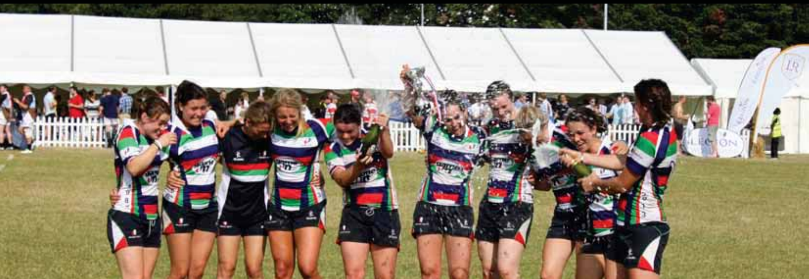
The Women's side celebrating the end of a fantastic season with another win at the Legends Rugby Festival

After months of planning and discussion Wooden Spoon's invitational Men's and Women's 7's sides finally gathered at Birmingham airport in early May, ready to fly to Kinsale to kick-off an extremely ambitious 2013 7's season.