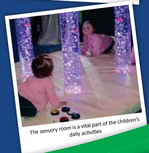
The sensory room is a vital part of the children's daily activities