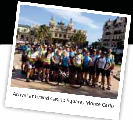
Arrival at Grand Casino Square, Monte Carlo

The journey of a life time for many of the riders followed, providing what has to be one of the most memorable journeys ever to a corporate conference. From the flat lands of Northern France down through the stunning Loire Valley and then over the iconic French Alps – an amazing route with climbs of over 30 miles long and vistas which are