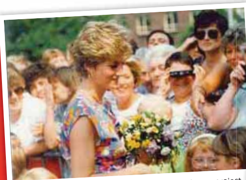
HRH Diana, Princess of Wales at a Wooden Spoon project opening in 1992