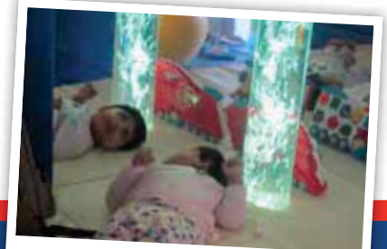
Stepping Stone's children enjoying the new sensory room

On behalf of the Children, Staff and Parents we would like to say a very big THANK YOU to you all!