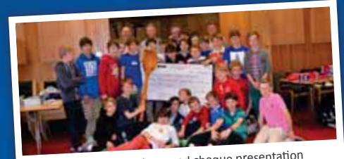
The P7 mini rugby squad cheque presentation

Scotland Spoon would like to thank everyone involved at the Stewart's Melville RFC for raising the funds which enables us to continue to support projects and make a continuing difference to thousands of disadvantaged children and young people in the region.