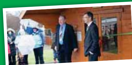
The official opening of our outdoor classroom (December 2012)