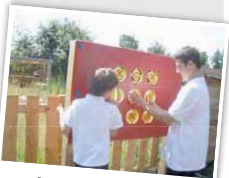
Students enjoying the sensory avenue

Wooden Spoon funded £35,000 towards the sensory avenue which enables students to work and play, outside the confines of the school building. The avenue includes opportunities for balancing, listening, seeing and feeling to provide the pupils with a stimulating environment. This includes bamboo bridges, tunnels, percussion boards, water features and a range of activity equipment which is mounted onto an all weather surface.