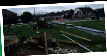
A work in progress!

Our outdoor area prior to development. There was little to motivate the pupils and stimulate their curiosity.