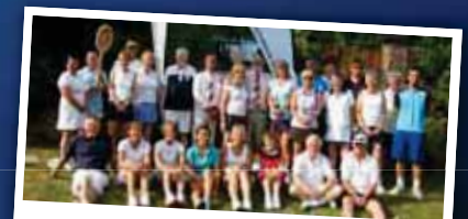
A grand day at the mixed doubles tennis tournament

The afternoon was rounded off with tea and Pimms on the Club's balcony.