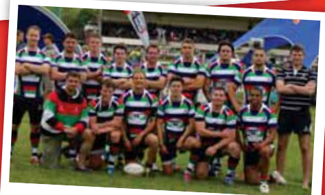
Men's side at Rugby Rocks