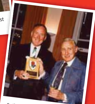
Spike Milligan with Peter Scott at the Help a child to see project in 1984