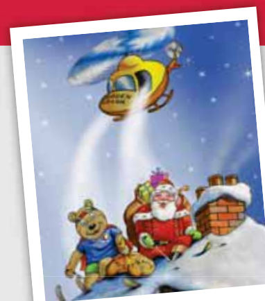
Spoony Christmas Card

By purchasing your cards through Charity Christmas Cards, Wooden Spoon will receive 50p per card purchased. To request a brochure please contact charity@woodenspoon.com or you can view the whole collection by visiting charitychristmascards.com/woodenspoon .