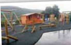
The new play area at Miskin Primary School