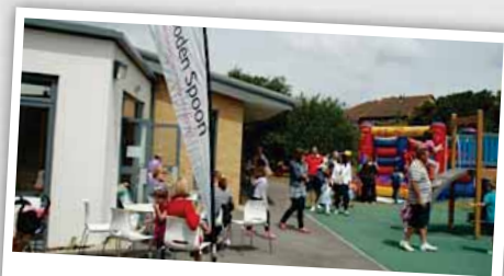
Family fun day at Orchards

Spoony was also in attendance and was a great hit with all the children and parents.