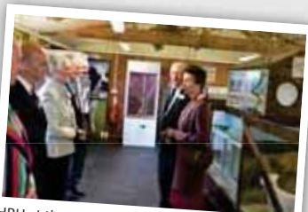
HRH at the opening of Ferring Country Centre

The Princess Royal unveiled a plaque, met members of the Wooden Spoon HQ and Sussex Wooden Spoon, chatted with the centre's trustees, staff and clients and had a tour of the centre including the small animal farm, the garden centre and the indoor riding school.