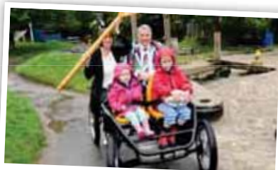
Wooden Spoon Scotland