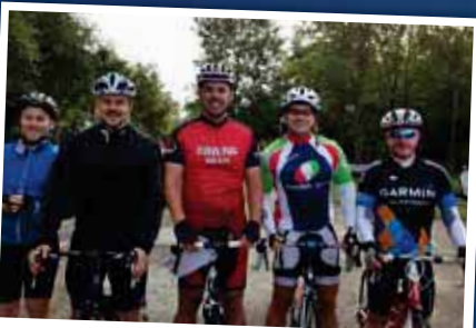
Wooden Spoon Valeriders

It is anticipated that over £5000 will be raised for projects in Wales.