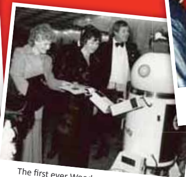
The first ever Wooden Spoon Ball 30th November 1984