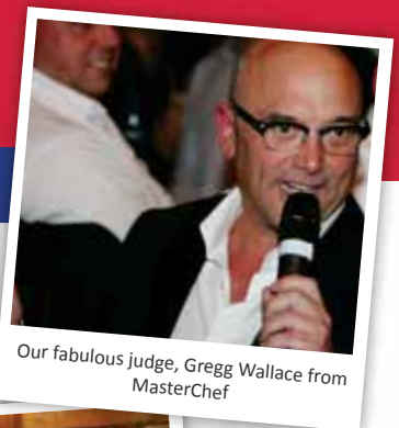
Our fabulous judge, Gregg Wallace from MasterChef