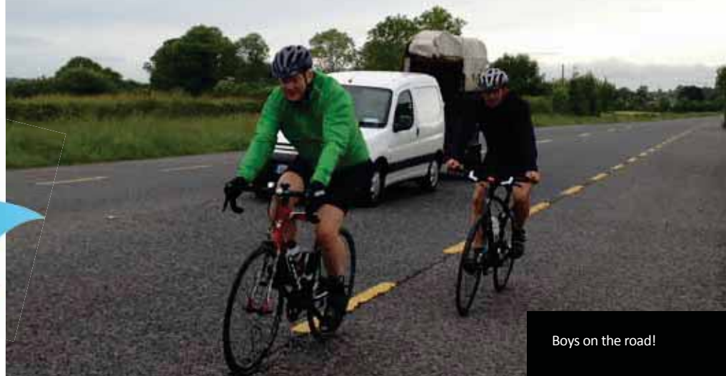
Boys on the road!

Sponsored by Black Sheep Brewery, the challenge has raised a fantastic £11,380.25 for the Yorkshire region of Wooden Spoon. A huge congratulations and thank you to all involved in this outstanding challenge.