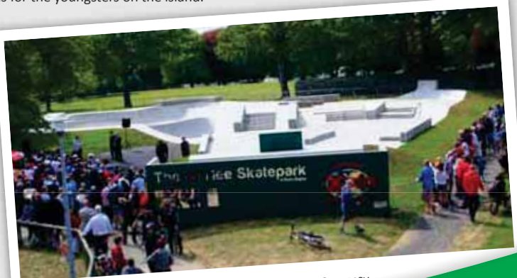
The GXSA Jubilee Skate Park in Guernsey.

The Jubilee Skate Park is Guernsey's only dedicated skate park and it has been the project of the Guernsey Extreme Association (GXSA) which is a charity with a specific mandate to provide skateboard facilities and experiences for the youngsters on the island.