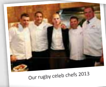
Our rugby celeb chefs 2013