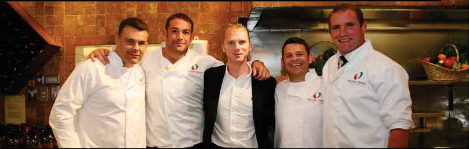
Nick Easter, Olly Kohn, Wayne Barnes, Lee Mears and Phil Vickery at this years Scrum Dine with Me.

Wooden Spoon are extremely fortunate to have some of the biggest names in the world of rugby choosing to support the charity. Year after year past and present players, coaches and rugby personalities have continued to support Wooden Spoon in any way they can, from embarking on epic challenges, speaking at events, opening projects to supporting us via social-media and donating auction items.