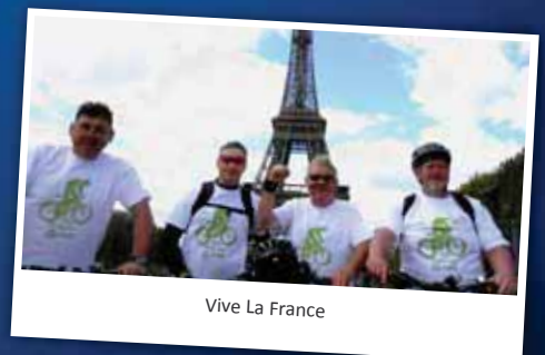
Vive La France