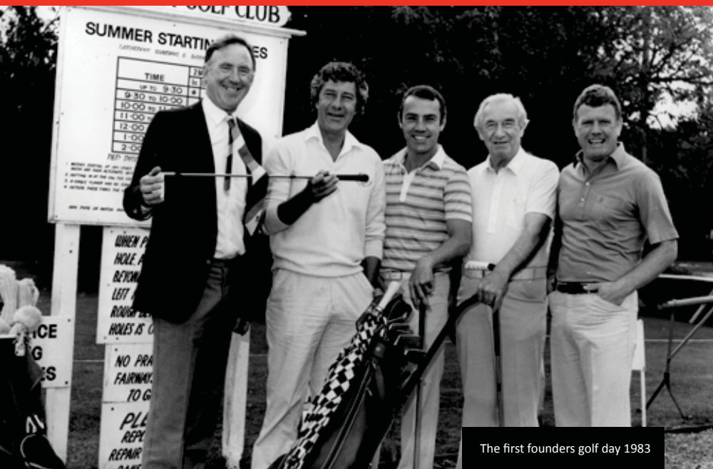
The first founders golf day 1983

With celebrations in full swing for the 30th Anniversary it is safe to say that Wooden Spoon Golf has celebrated in style. Starting in Portugal and finishing at The Oxfordshire for our National Golf final in October, it really has been an exciting few months.