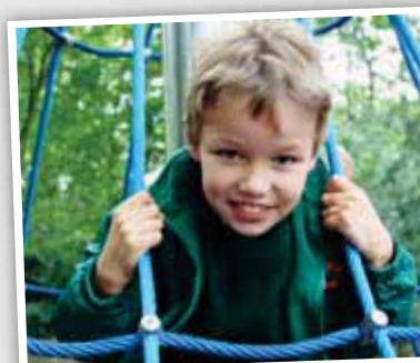
I Can Meath School enjoying their new play equipment

children, aged 4-11 years, many of whom are unable to communicate verbally. Most of the children are day pupils but all of them stay overnight for a minimum of one night per week in order to enable them to mix socially outside school times. This is considered an essential part of their educational programme as, when they return home, the severity of their condition means that they are unlikely to enjoy any peer play group activity.