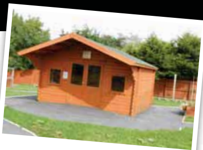
Our outdoor Classroom

Project Name: Coppice School, Lancashire Project Type: Outdoor classroom Wooden Spoon Donation: £6,500 Opened by: Bill Beaumont CBE