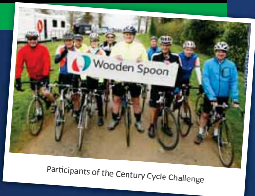
Participants of the Century Cycle Challenge

The former Tiger lock forward raised £1900 through Just Giving. In his absence, on the 4th May the Tigers past players held a Tigers v London Irish reunion match at Welford Road and raised a total of £210.