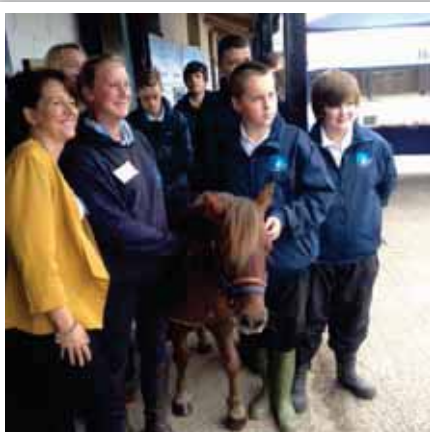
A group from the Discovery Programme

Measurable outcomes have shown that for these troubled and vulnerable youngsters anti-social behaviour can be calmed and levels of concentration and communication enhanced; and those suffering from restricted development can demonstrate previously unseen levels of self-confidence and team-building skills.