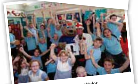
Wooden Spoon Wales