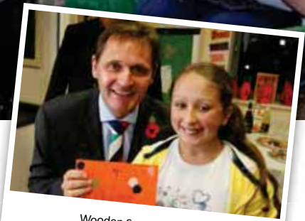
Wooden Spoon Yorkshire

Wherever you live and whatever your background, your local region is always pleased to welcome new volunteers. If you would like to help Wooden Spoon in making a difference to the children and young people we support, please get in touch with your local regional chairman. Their details can be found on the back page of this issue.