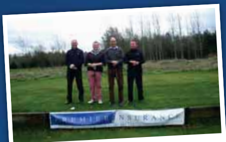
Golfers at the Northumberland Golf Day

In all we should see something like £4500 added to the coffers to support future projects in Northumberland.