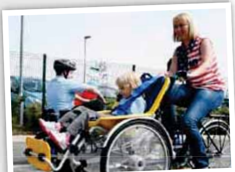
A young child enjoys the new Interactive Road

Chellow Heights is a generic special school for learners aged 2-11 years. Situated in the west of Bradford its population reflects the diverse community of the area. It is located within a campus of schools, Heaton Primary, the Acorn Centre, a Children's Centre, Belle Vue Girls and Belle Vue Boys High School.